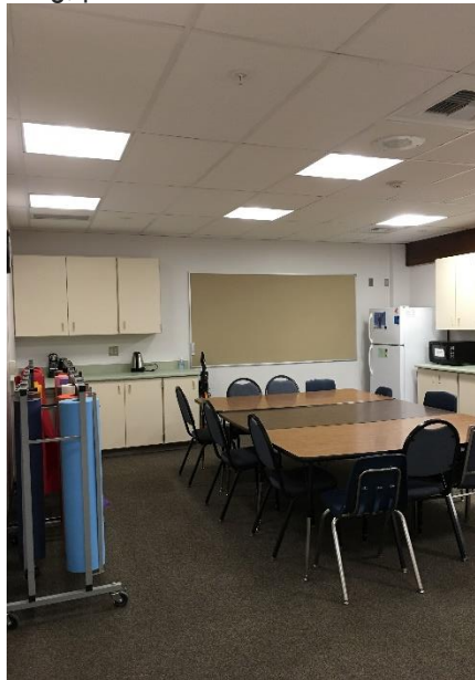
NEW ES STAFF LOUNGE