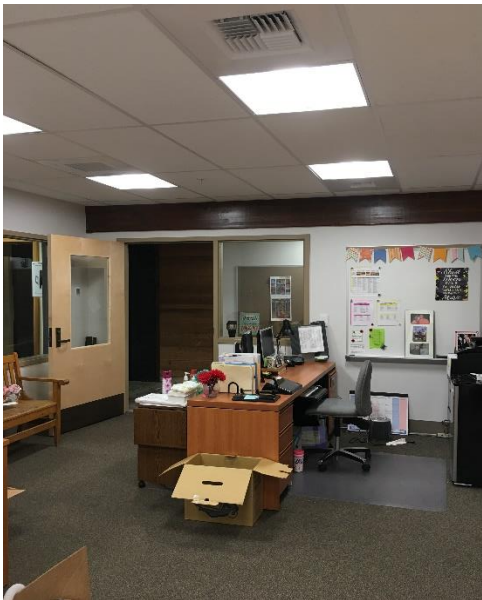
NEW ES OFFICE OPEN FOR BUSINESS