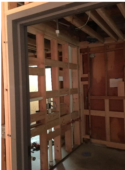
NEW FRAMING AND ROUGH PLUMBING