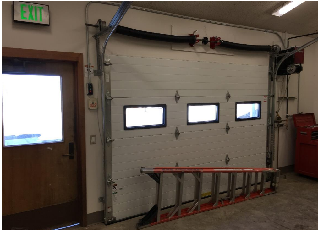
NEW OVERHEAD GARAGE DOOR IN INSTRUCTIONAL SHOP