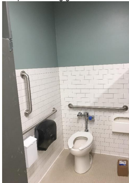
NEW PLUMBING FIXTURES AND ACCESSORIES IN ES20 GIRLS' RESTROOM