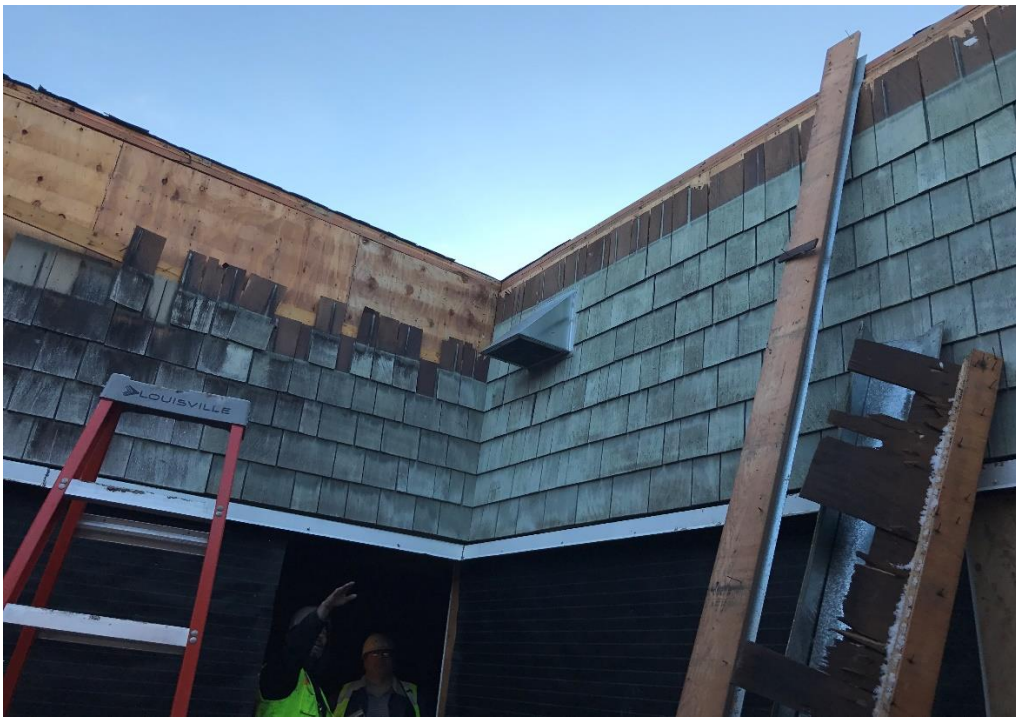
ES POD ATRIUM PREPARING TO ENCLOSE WITH NEW ROOF