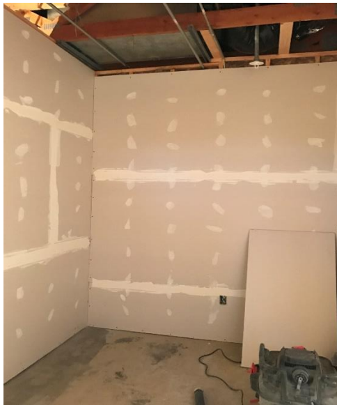
ES NEW DR WALL AND FINISH