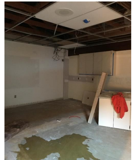
RELOCATE CABINETS IN FACULTY LOUNGE