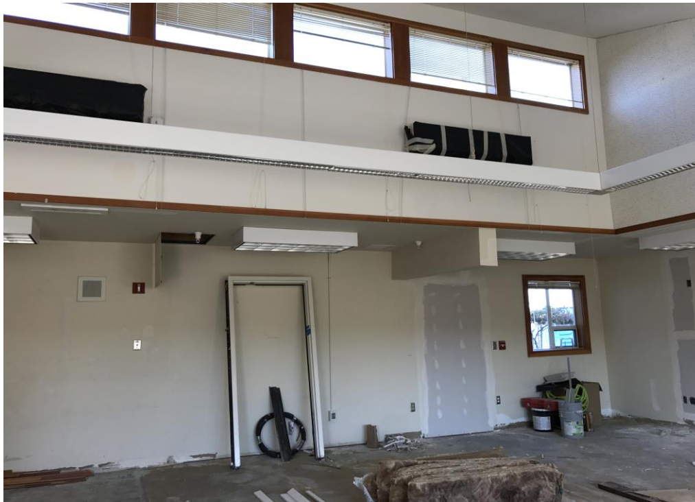
NEW DRYWALL INFILL AND PATCHING IN ELEMENTARY ROOMS