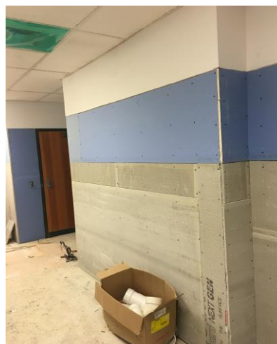
NEW DRYWALL AND TILE BACKER BOARD IN RESTROOMS