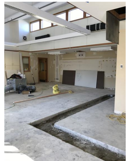
TRENCHING ELEMENTARY FLOORS FOR NEW SANITARY LINES