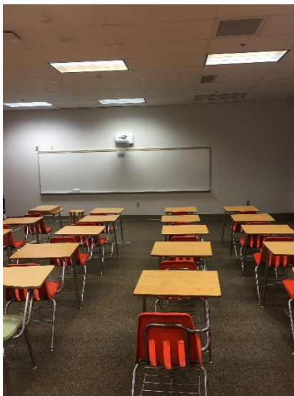
COMPLETED REFRESHED CLASSROOMS