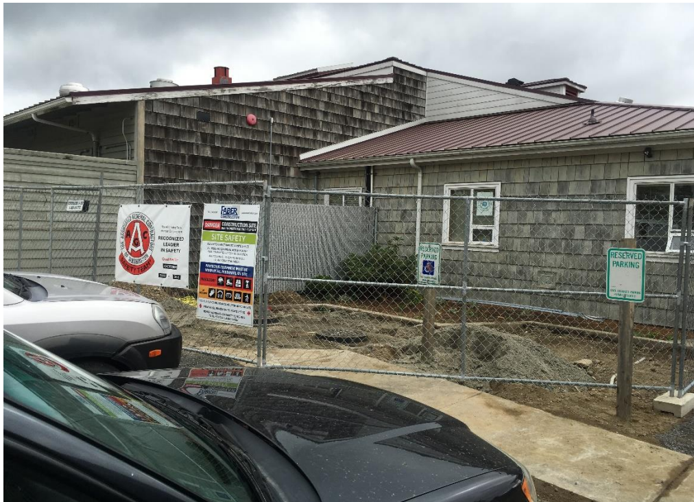
SECURE / PROTECTED AREAS AND SAFETY SIGNAGE