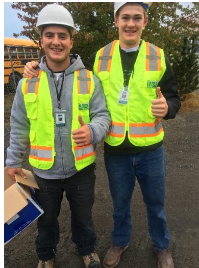
CONSTRUCTION STAFF WITH PERSONAL PROTECTIVE EQUIPMENT AND IDENTIFICATION BADGES