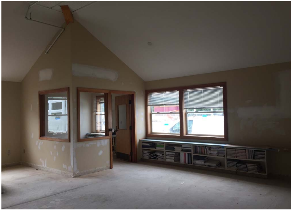
DRYWALL PATCH AND REPAIR IN MS / HS CLASSROOMS.