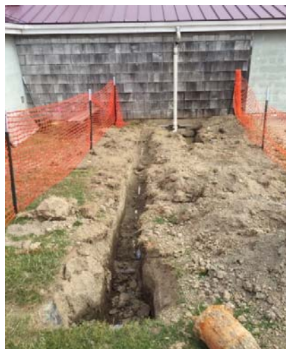
MISCELLANEOUS EXTERIOR CIVIL WORK.