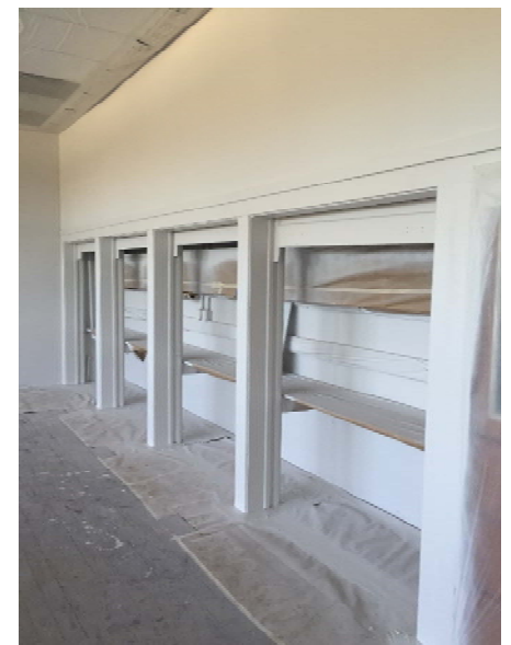
MS / HS CLASSROOM DRYWALL PATCHING AND PAINTING.