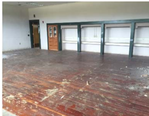
DEMOLITION OF EXISTING FLOORING IN MS / HS CLASSROOMS.