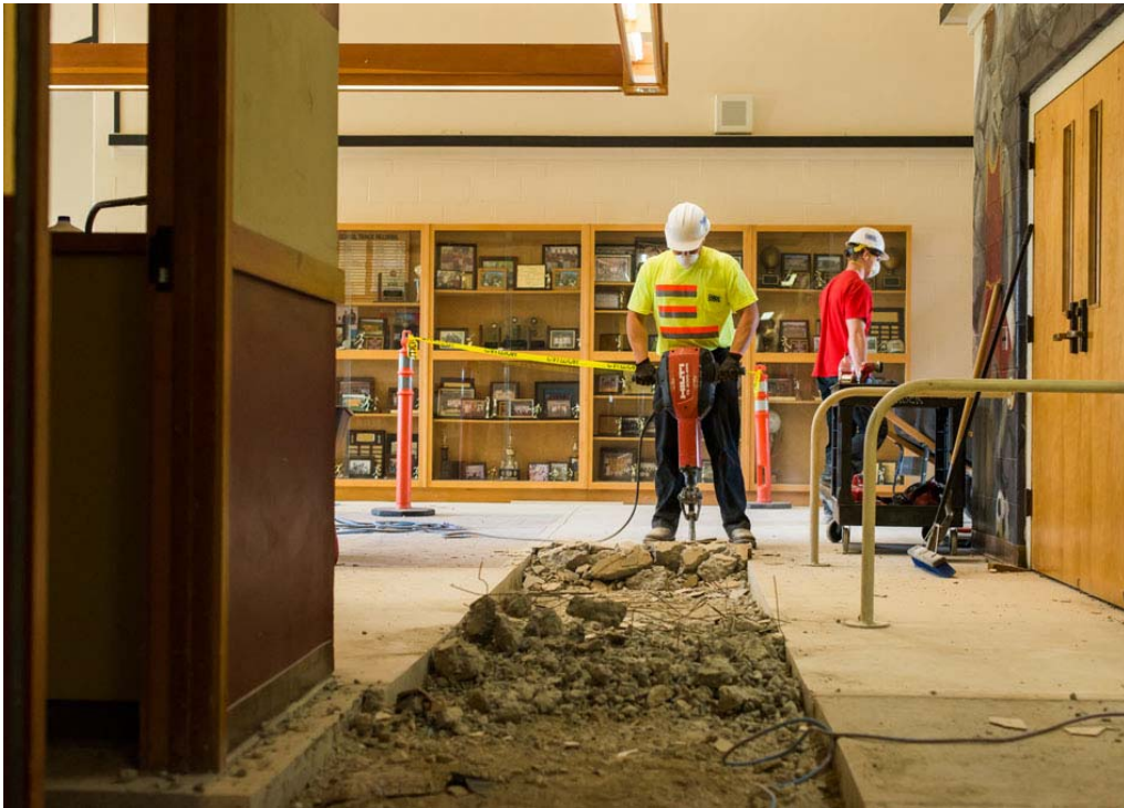
DEMOLITION OF THE CONCRETE SLAB IN MS / HS CORRIDOR.