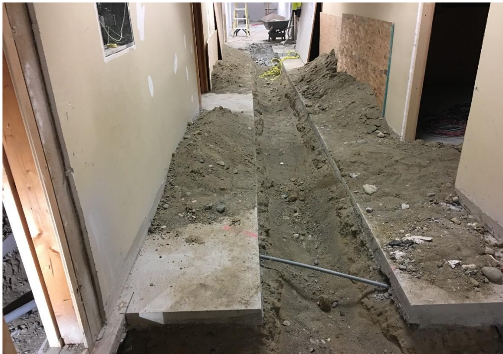
TRENCHING FOR NEW PLUMBING LINES AT ES RESTROOMS