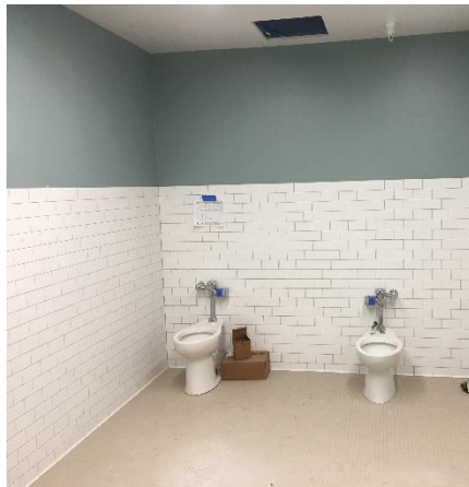
NEW FIXTURES IN ES GIRLS' RESTROOM