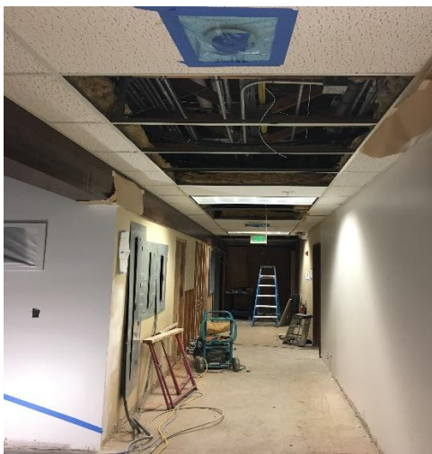
NEW FINISHES IN ES HALLWAYS